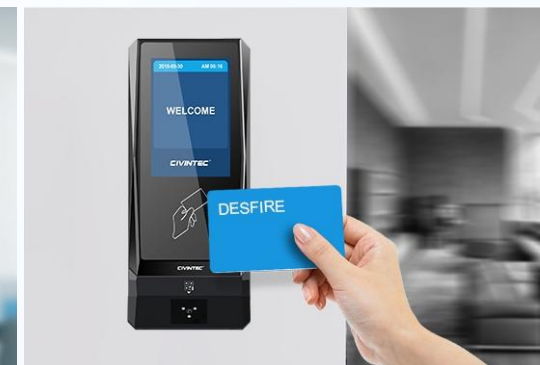
RFID smart card