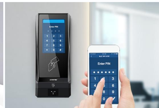
BLE mobile credential