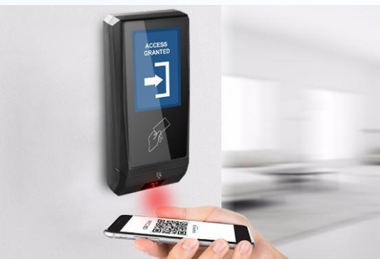
QR Code & Barcode