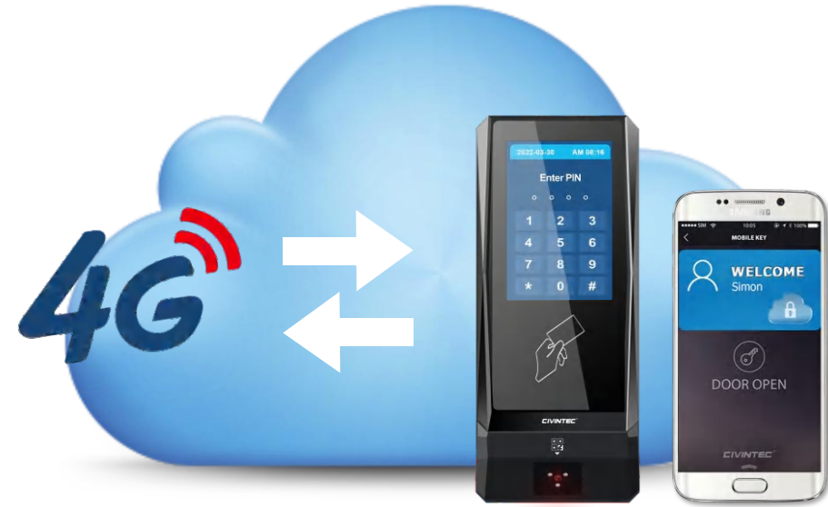
4G & TCP/IP Cloud-based Security & IoT Terminal

CT9 Pro gives easy access for user to customize UI and TEXT displayed on 3.5" touch screen through config software tool or remote server, with embedded relay control and rich commands to build versatile IoT and security applications.